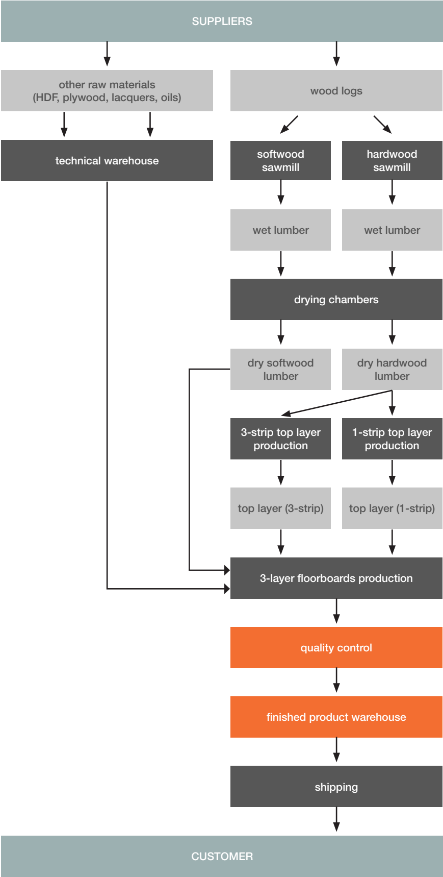
Fig. 4. A scheme of the 3-layer wooden floorboard production by Barlinek factory (Poland) v

The Barlinek Group is a manufacturer of an engineered flooring. As well as the Barlinek flooring, the Barlinek group also produces certified flooring for sporting facilities, skirting boards and wood biofuels.