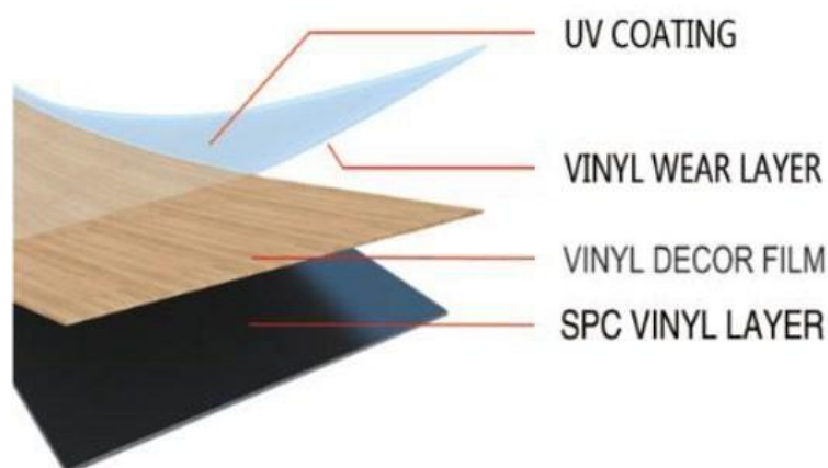
Figure 1. Construction of SPC flooring

Stone plastic composite (SPC) flooring is a rigid plastic floor, which can also be bent, but compared with LVT floor, the degree of curvature is much less. The following figure shows the structure of SPC product, from bottom up, the tile is composed of several layers, i.e. the SPC vinyl layer, the vinyl decor film, the vinyl wear layer and the UV coating layer.