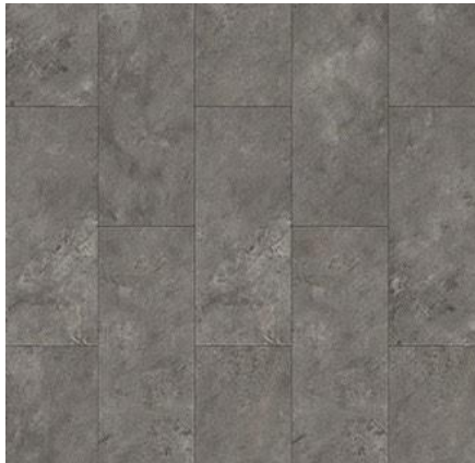
HUALI STONE PLASTIC COMPOSITE (SPC)